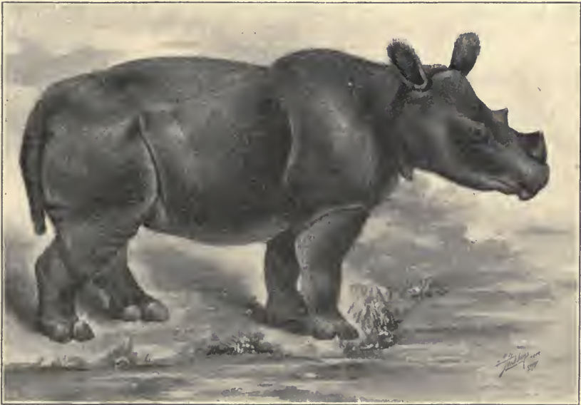
FIG. XXV. RHINOCEROS SUMATRENSIS. SUMATRAN RHINOCEROS.